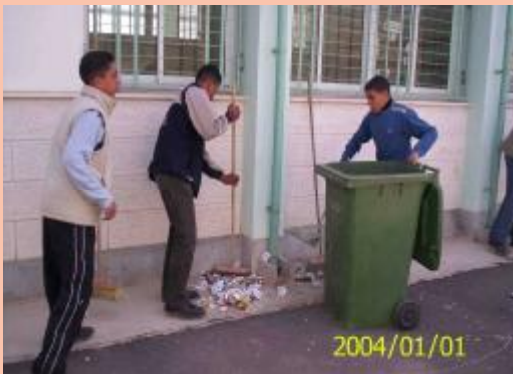
Students clean the area around the Huda Abd al Nabi School - Boys can be clean too!

One teacher from Huda Abd al Nabi School for boys was amazed at the boys efforts to clean the school grounds and the inside of the school!