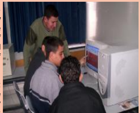
Students work on the school website and teach one of their teachers how to design a page!