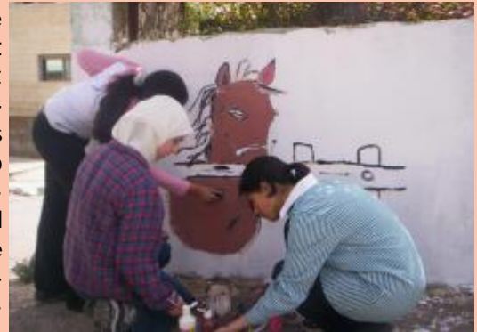
Students from Khawlah Girls School beautifying their school by painting an original mural on the school wall.

On various dates throughout April, students from all five Schools Online GCEP schools participated in their first Global Youth Service Day (GYSD). GYSD is a global event organized by American Youth Service to promote volunteering among the world's youth. Teachers used Schools Online's Improving Your Community teaching module to motivate the young people and inform them of the possibilities that volunteering can bring. According to teachers and students, youth contributed to their community while learning valuable lessons in volunteerism, community development/building, responsibility, environmental awareness and technology. All five Schools Online schools — Khawlah Bent Al Azwar, Al Hashemya, Wedad Naser Elden, Al Awdah and Huda Abd Al Nabi schools participated in the GYSD. There were 11 groups totaling over 400 students! The groups performed various projects such as planting unused areas, drawing and painting murals on school walls, visiting a center for elderly women, and visiting a special needs Center as well as a center for homeless children. All of these activities were done with the cooperation of local groups such as Sharek Youth Forum, local businesses and municipalities throughout the region. Please read on to see more...!