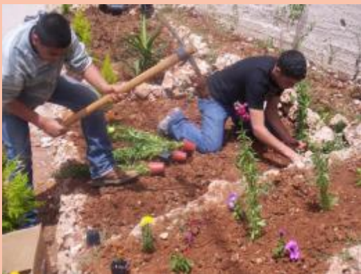
Students from Al Hashemya Boys School plant trees and flowers to beautify the entrance of Qalandia Camp.