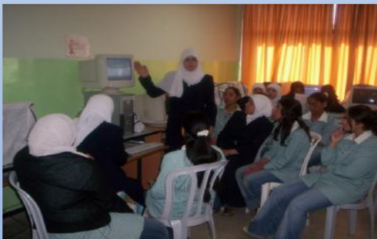
A group leader makes a plan with her fellow students !